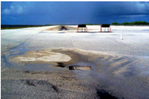
Figure 4.2 Runway rainwater catchment, Majuro, Marshall Islands

Cyclones and earthquakes may damage artificial catchments such as rooftops and aircraft runways (e.g. Majuro). Volcanic ash showers are known to deposit ash material on catchment surfaces and in open storage reservoirs. Artificial catchments are also subject to seawater spray (increased during cyclones) that may find its way into reservoirs thus contaminating stored freshwater.