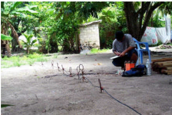
Figure 4.6 Groundwater monitoring, Majuro, Marshall Islands

Monitoring the thickness of freshwater lenses is the only way to determine the amount of groundwater available. Abstraction rates can then be adjusted accordingly. Increased pumping rates to meet demand during drought conditions may result in saltwater intrusion, by shrinking the thickness of the freshwater lens that is situated above more saline groundwater.