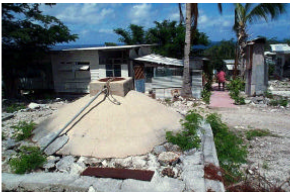
Figure 4.3 Rainwater storage tank, Banaba, Kiribati

It is good practice to monitor storage levels or volumes to account for changes. For example a broken water main or damage to the reservoir may cause a sudden unexpected decrease. The ability to isolate a storage facility is also desirable during and/or after a natural disaster to save water that may be lost or wasted through damage to the reticulation system. Outlets from storage facilities should be closed after an event to save wastage of stored water through leaks and broken pipes. Once it is known that major distribution faults are under control then the storage facilities can be opened, resulting in minimisation of water wastage.