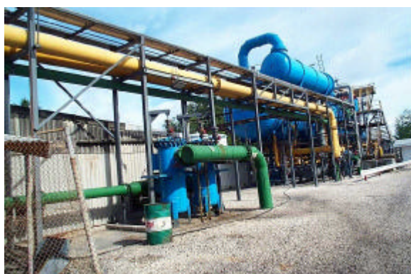
Figure 4.1 Multi-stage Flash Desalination Unit, Nauru

This survey could easily be extended into an asset register of facilities and would be a valuable document in itself. Note that this may present a good opportunity for a water utility to review its plan record system (ie. the storing and retrieval of plans, specifications and other information). A utility may want to upgrade its existing system, to use the latest GIS and GPS methods to store, retrieve and print water facility systems. Once water systems are recorded in a GIS system, reticulation networks can easily be modelled thus giving the utility another tool to better managing reticulation systems.