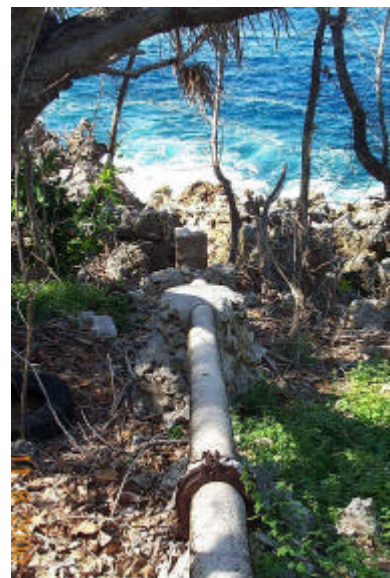
Figure 4.5 Sewage outfall, Banaba, Kiribati

Sewerage outfall structures and pipelines are susceptible to natural hazards and should be examined after major events to ensure their integrity.