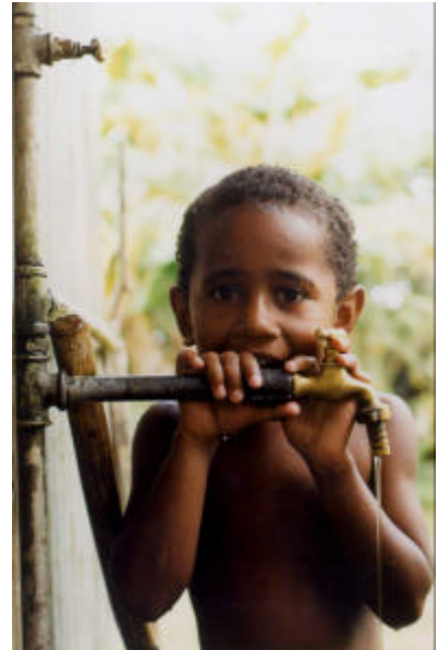
Figure 4.4 Rural water supply, Fiji

The use of an appropriate pipe material can minimise breakages. PVC pipes should always be buried while steel pipes are most suited for out-of-ground use.