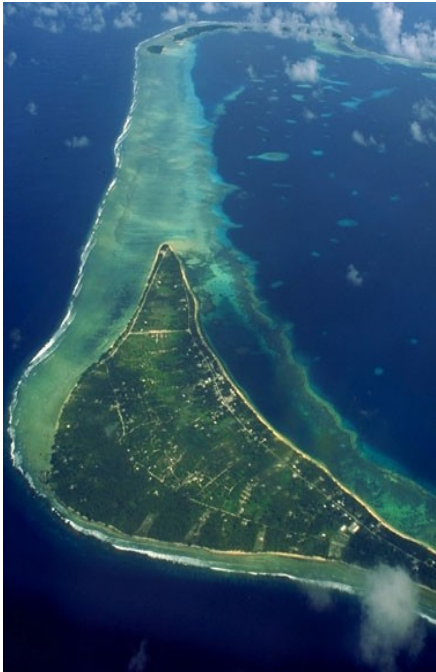
Image 1. Laura Village from the air.