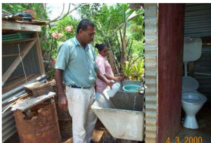
Figure 10: Tap is left open to flush the system before collecting sample.

The sample bottle should be labelled with an identifying number or code. At the time of sampling this should be written down along with other information such as the date, time, location, and weather. For coastal water samples it is advantageous to take GPS measurements that can be plotted on a map or used to return to the same site in the future. Also for coastal water samples it is important to note the time and heights of the high and low tides and sea information.