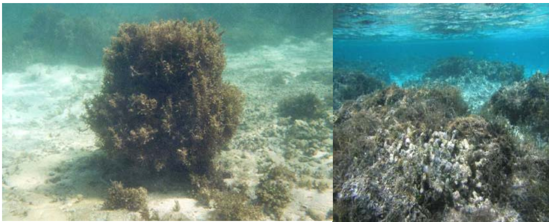
Figure 5: Photos of algal dominated reefs, an indication of nutrient pollution and overfishing.

At the higher nutrient levels normally found in rivers and creeks, measurements could be performed as detailed in the drinking water section of this report but this would be less accurate.