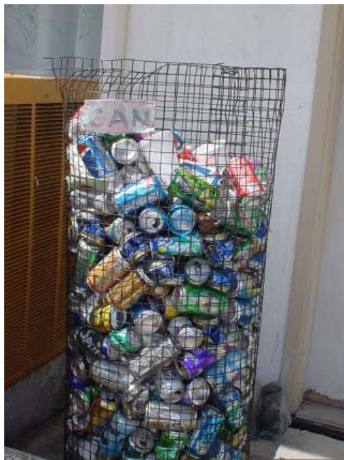
Figure 9: Collection for recycling.

The South Pacific Regional Environment Programme (SPREP) has further information related to solid waste 2 .