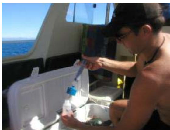
Figure 11: Filtering seawater samples to be tested for nutrients.

For nutrients , if a delay between sampling and analysis is inevitable it is best to filter the samples in the field and place samples on ice/refrigeration. The nutrient levels may decrease if this is not performed, as any plankton and micro-organisms present may continue to use them. This is especially important in coastal water samples where nutrient levels are low so large changes may occur in a short space of time. A simple filtration device consisting of a 50-100 mL plastic syringe, and a plastic filter holder (e.g. Swinnex type from Gelman Sciences) to fit a 47 mm glass fibre filter (1.2 µm pore size, GF/C) is satisfactory.