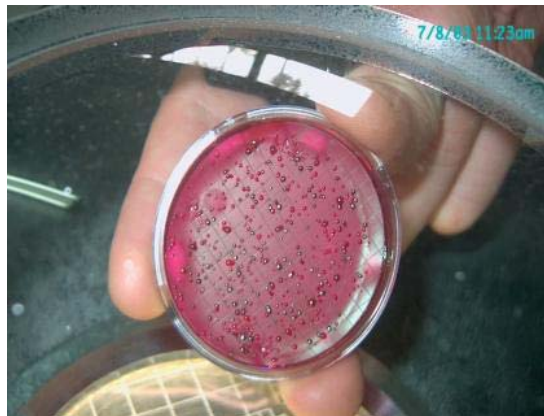
Figure 1: Bacteria colonies growing on an agar plate.

Indicator bacteria may be measured using a variety of methods, most involving incubation on an agar media (to provide nutrients for organisms) at a set temperature (e.g. 44.5°C) and period of time (e.g. 24 hours), followed by counting of the number of bacteria colonies present. These operations can be performed in the field using portable battery-powered incubators (e.g. Millipore Field Microbiology Tests Kit).