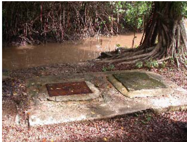
Figure 7: Septic tank poorly sited on a tidal creek.

Septic tanks are probably the most common form of sanitation technology in the Pacific but these provide very limited treatment of sewage and contamination of groundwater often occurs when septic tanks fail because of poor maintenance (Dillon 1997). When septic tanks become full of sludge, the treatment time in the tank is reduced, the sewage can backflow if the perforated pipe becomes clogged, and continuous (rather than intermittent) seepage of effluent occurs. Septic tanks and pit latrines need to have sludge removed at intervals of between 2-10 years (depending on amount of usage). The sludge must also be disposed of properly and this should not be done in proximity to any water supply well. Sludge can be dried and incorporated with compost and spread (in thin amounts) over garden soils or under forests.