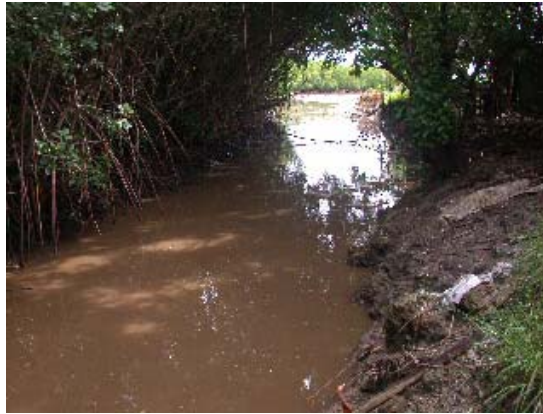
Figure 3: Highly turbid creek flowing out through a mangrove area.

phytoplankton, and bottom dwelling plants and animals. High turbidity also makes swimming and diving more dangerous due to the reduced visibility.