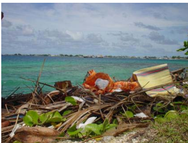
Figure 8: Litter poorly disposed off or washed up on a beach.

A serious problem in many Pacific Islands with limited land areas is the disposal of non-biodegradable items (plastics, rubber, metal). This is a complex problem, related to the industrialisation of many countries resulting in the increased use, import and manufacture of these items.