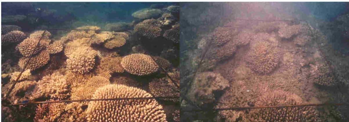
Figure 4: Photos of before (left) and after (right) a sediment discharge has occurred on an area of coral reef. A number of coral species have been killed.

Coral reefs close to the shoreline and/or large rivers are very vulnerable to high sediment/turbidity levels. The sediment smothers the tiny coral animals, reducing light levels and eventually killing the coral.